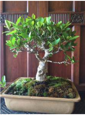
Ficus Natalensis - First Tree

Your First Bonsai Tree: A Ficus Natalensis (purchased in Dec 2005). I still have it although I have put it through a few different styling ideas.