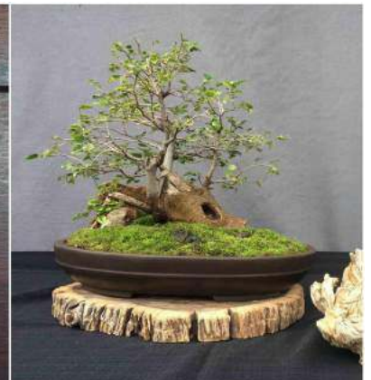
Raft style Celtis Sinesis