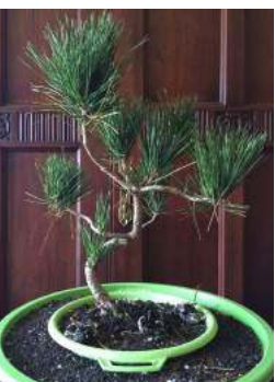
JBP grown from seed