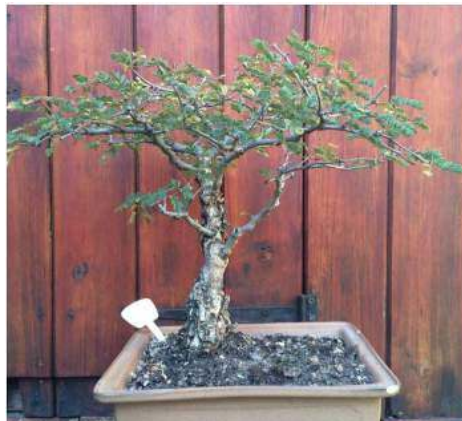
Black Monkey Thorn