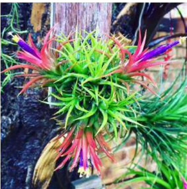
Tillandsia ionantha rubra

Best advice you can give: surround yourself with people who have good Bonsai knowledge. You will see your collection go from strength to strength.