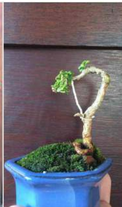
Mame Literati Serissa